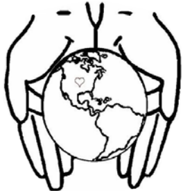
Hands of Mercy

“Children around the world are touched by our Hands of Mercy.”