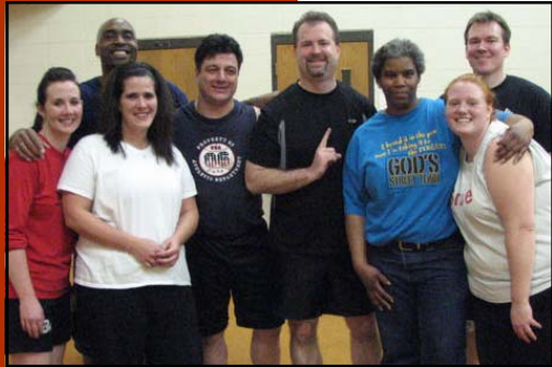
Team Howard (left) and Team Waldo (right)